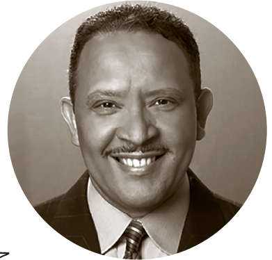
MARC H. MORIAL President & CEO

A handwritten signature in black ink, appearing to read "m h morial", written in a cursive style.