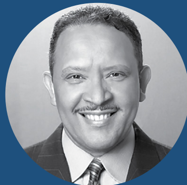
MARC H. MORIAL President & CEO

In a year that battered Black America on three fronts – a deadly virus, a crushing recession, and an eruption of racial tension – the Urban League Movement rose to meet the unprecedented challenges of 2020 with historic effort and commitment.